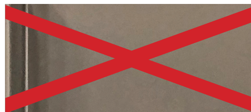
Flat Not Recommended